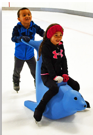
BOBBY THE SEAL SKATE AID & RIDE!

If you would prefer to rent the facility for a private party, please contact us for rates and availability. Saturdays 4:45-6:30 p.m. are usually available for rental at $ 495.00. For details, call 865-588-1858.