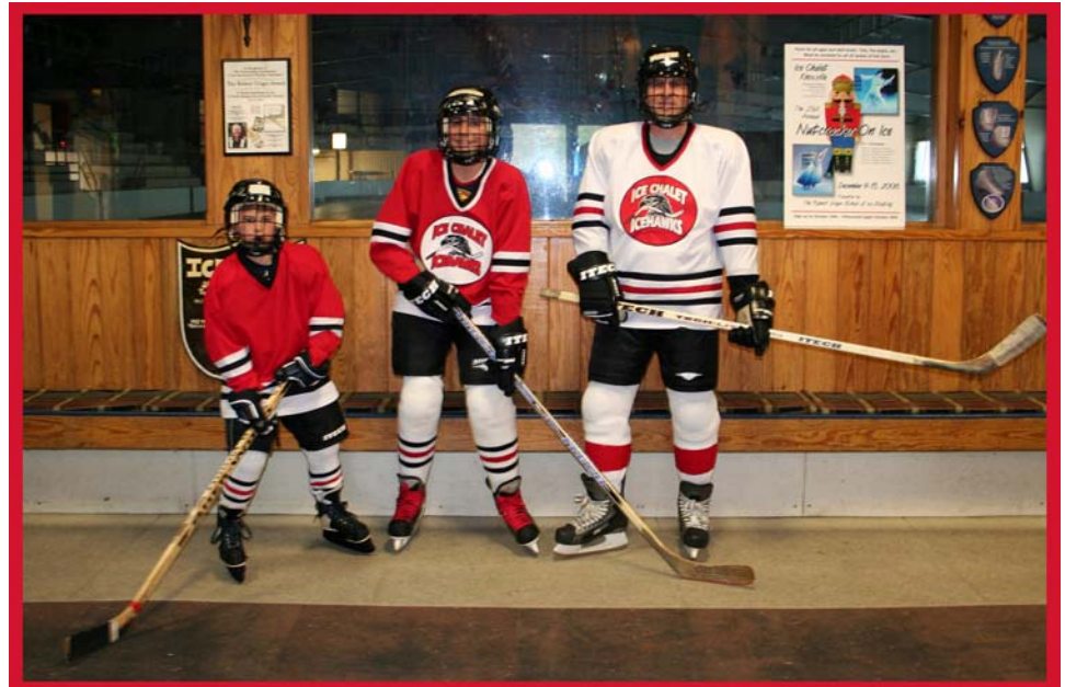
Last Step -- Hockey Stick & A Great Attitude!

REMEMBER -- When removing your equipment, re-attach all velcro straps before storing them in your bag. And please launder your jersey and socks after each use.