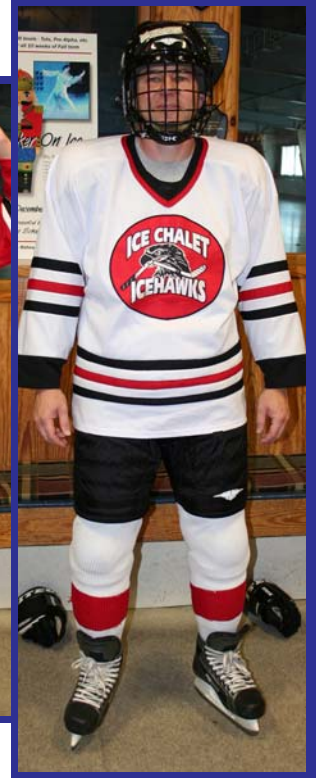
Step 9 Helmet