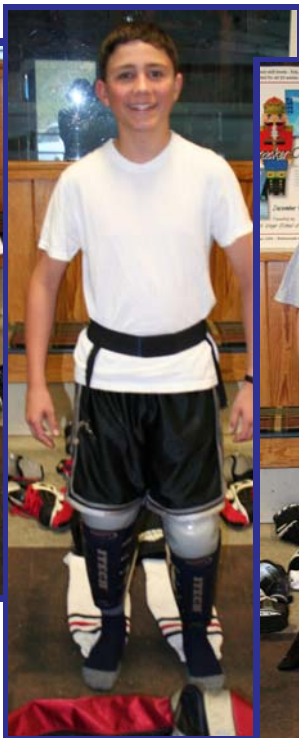
Step 2 Shin Guards