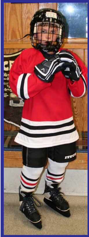
Step 10 Gloves