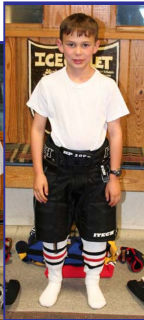
Step 4 Pants (with or without suspenders)