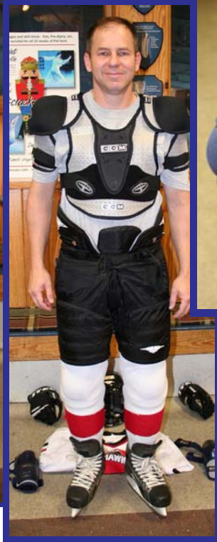
Step 6 Shoulder Guards