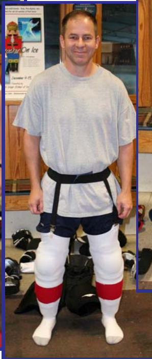
Step 3 Socks