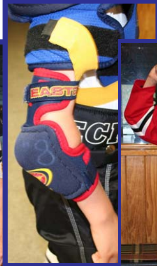
Step 7 Elbow Guards