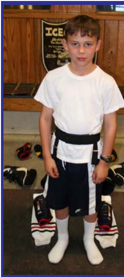
Step 1 Garter Belt