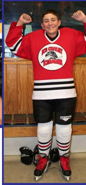
Step 8 Jersey (Roll up hem in front of your chest, grab with both hands & lift over head)